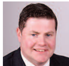
Mayor Seamus Ó Domhnaill, Donegal County Council