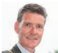
Mayor John Boyle, Derry City and Strabane District Council

9:05am: Welcome: Mayor John Boyle, Derry City and Strabane District Council Mayor Seamus Ó Domhnaill, Donegal County Council