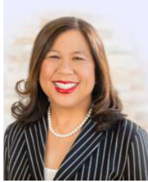
Betty Yee Former California State Controller